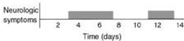
Figure 1. Plasma concentrations and dosages of carbamazepine and untoward symptoms in case 1. Even though concentrations remained within therapeutic range, administration of carbamazepine produces untoward symptoms and symptoms disappear after withdrawal of carbamazepine.

phenytoin CBZ 66 가 CBZ 2.2 µg/mL , CBZ CBZ , Salzman Pippenger 3 CBZ 16 10.1 µg/mL , Aguglia 5 CBZ (tic-like movements) CBZ CBZ Dhuna 6 CBZ CBZ , 가 carbamazepine-10,11-epoxide(CBZ-E) CBZ CBZ-E 7-8 CBZ-E 9 CBZ CBZ-E가